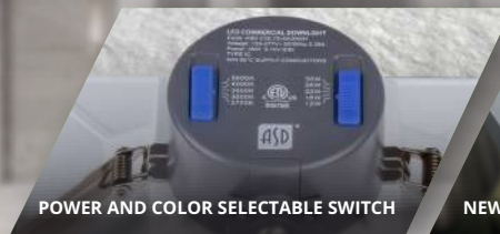
POWER AND COLOR SELECTABLE SWITCH