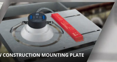
NEW CONSTRUCTION MOUNTING PLATE